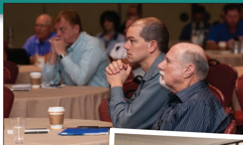
Top: Listening to presenters during the R&D Session and the Class I Purchasing Session.

Back to business on Friday, attendees heard from a variety of professionals from the R&D world who shared the latest research related to wood preservatives and testing developments. The greatly anticipated Railroad Purchasing Forum, where the Class 1 railroad executives in attendance share their companies' rail tie purchasing plans for the coming year, followed this session.