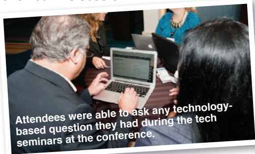
Attendees were able to ask any technology-based question they had during the tech seminars at the conference.