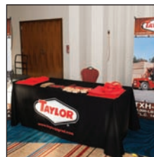
Taylor Machine Works