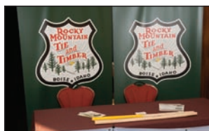
Rocky Mountain Tie and Timber