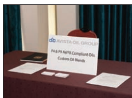
New RTA Member, Avista Oil Group, was in attendance.