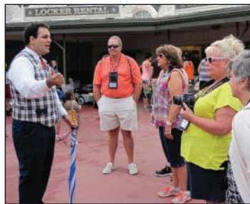
Disney's Keys to the Kingdom Tour was a sell-out!