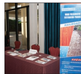
Wood Care Systems