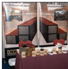
Arch Wood's display