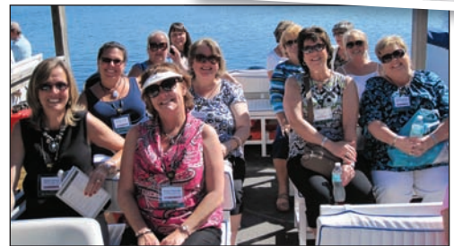
The ladies of RTA smile for the camera as they take their boat tour around Winter Park.