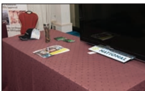
National Salvage and Service Corp.